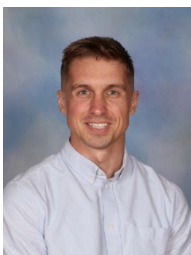
Year 10 Girls