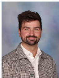
Year 7-9 Girls