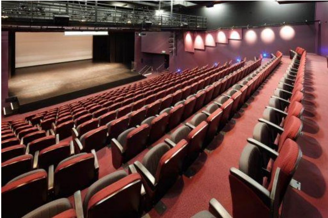
School Hall (500 Occupancy, 300 seats available)