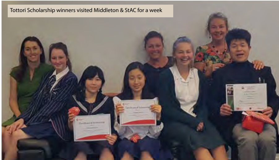
Tottori Scholarship winners visited Middleton & StAC for a week

The annual International College BBQ was held on February 27th. What a wonderful occasion, with homestay families, parents, care providers, agents, pupils and staff all enjoying the wonderful weather and excellent food! We had approximately 350 attend this event and it was wonderful to see new friendships being made, old acquaintances reconnecting and just enjoying a time to relax together. Thank you to everyone who came and shared this event with us.